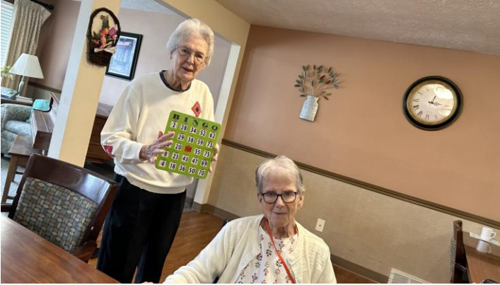
Thank you Coopersville Community & Family Dollar for all of the candy bars!