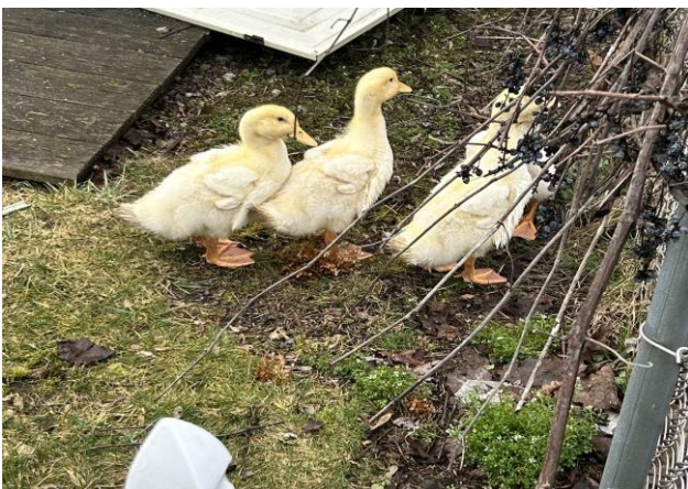
Growing fast and exploring the outdoors in just a few short weeks.